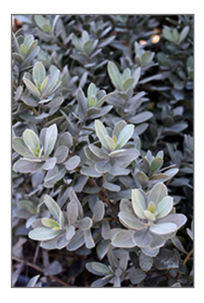
Silver Buttonwood foliage