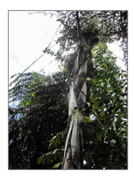
Giant Fishtail Palm bark

Giant Fishtail Palm is a fine choice for the yard, but it is also a good selection for planting in outdoor pots and containers. Because of its height, it is often used as a 'thriller' in the 'spiller-thriller-filler' container combination; plant it near the center of the pot, surrounded by smaller plants and those that spill over the edges. It is even sizeable enough that it can be grown alone in a suitable container. Note that when grown in a container, it may not perform exactly as indicated on the tag - this is to be expected. Also note that when growing plants in outdoor containers and baskets, they may require more frequent waterings than they would in the yard or garden. Be aware that in our climate, most plants cannot be expected to survive the winter if left in containers outdoors, and this plant is no exception. Contact our experts for more information on how to protect it over the winter months.