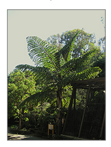
Giant Fishtail Palm