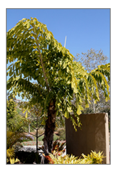
Giant Fishtail Palm

This tropical plant does best in full sun to partial shade. It does best in average to evenly moist conditions, but will not tolerate standing water. It is particular about its soil conditions, with a strong preference for rich, acidic soils. It is somewhat tolerant of urban pollution, and will benefit from being planted in a relatively sheltered location. This species is not originally from North America, and parts of it are known to be toxic to humans and animals, so care should be exercised in planting it around children and pets..