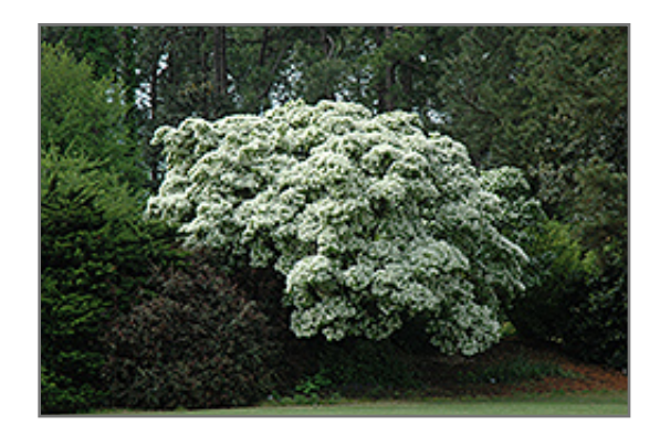
Chinese Fringetree in bloom

Chinese Fringetree is recommended for the following landscape applications;