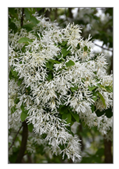
Chinese Fringetree flowers

This is a relatively low maintenance tree, and should only be pruned after flowering to avoid removing any of the current season's flowers. It has no significant negative characteristics.