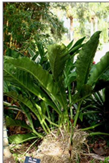
Birds Nest Anthurium

When grown indoors, Birds Nest Anthurium can be expected to grow to be about 24 inches tall at maturity, with a spread of 3 feet. It grows at a medium rate, and under ideal conditions can be expected to live for approximately 5 years. This houseplant performs well in both bright or indirect sunlight and strong artificial light, and can therefore be situated in almost any well-lit room or location. It does best in average to evenly moist soil, but will not tolerate standing water. The surface of the soil shouldn't be allowed to dry out completely, and so you should expect to water this plant once and possibly even twice each week. Be aware that your particular watering schedule may vary depending on its location in the room, the pot size, plant size and other conditions; if in doubt, ask one of our experts in the store for advice. It will benefit from a regular feeding with a general-purpose fertilizer with every second or third watering. It is not particular as to soil type, but has a definite preference for acidic soil. Contact the store for specific recommendations on pre-mixed potting soil for this plant. Be warned that parts of this plant are known to be toxic to humans and animals, so special care should be exercised if growing it around children and pets.