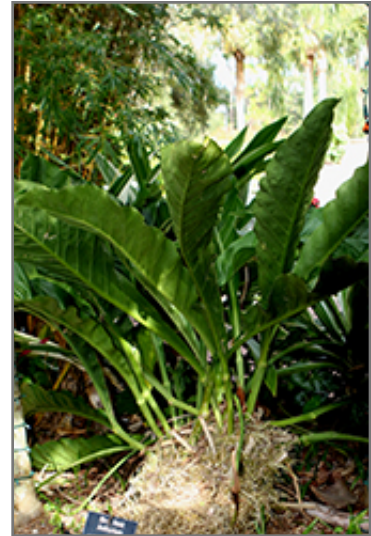
Birds Nest Anthurium

This plant does best in partial shade to shade. It does best in average to evenly moist conditions, but will not tolerate standing water. This plant will benefit from a regular feeding with a general-purpose fertilizer with every second or third watering. It is not particular as to soil type, but has a definite preference for acidic soils. It is somewhat tolerant of urban pollution. This species is not originally from North America, and parts of it are known to be toxic to humans and animals, so care should be exercised in planting it around children and pets. It can be propagated by division.