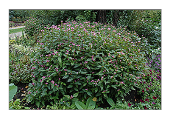
Pink Turtlehead in bloom

This plant will require occasional maintenance and upkeep, and is best cleaned up in early spring before it resumes active growth for the season. Gardeners should be aware of the following characteristic(s) that may warrant special consideration;