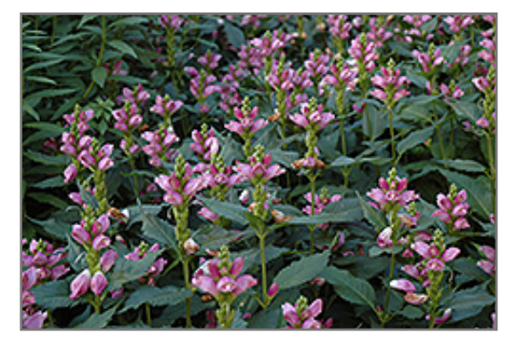
Pink Turtlehead flowers

Pink Turtlehead is a dense herbaceous perennial with an upright spreading habit of growth. Its medium texture blends into the garden, but can always be balanced by a couple of finer or coarser plants for an effective composition.