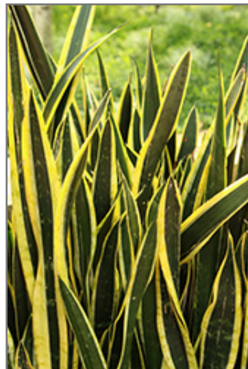
Black Gold Snake Plant foliage

This plant does best in partial shade to shade. It is very adaptable to both dry and moist growing conditions, but will not tolerate any standing water. It is considered to be drought-tolerant, and thus makes an ideal choice for a low-water garden or xeriscape application. This plant will benefit from a regular feeding with a general-purpose fertilizer with every second or third watering. It is not particular as to soil pH, but grows best in sandy soils. It is highly tolerant of urban pollution and will even thrive in inner city environments. This is a selected variety of a species not originally from North America. It can be propagated by division; however, as a cultivated variety, be aware that it may be subject to certain restrictions or prohibitions on propagation.