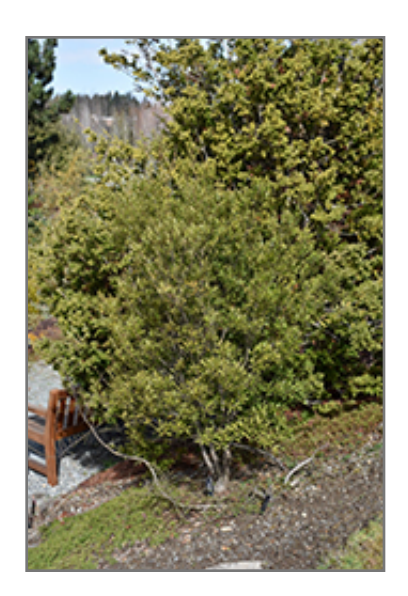
Magellan's Mayten