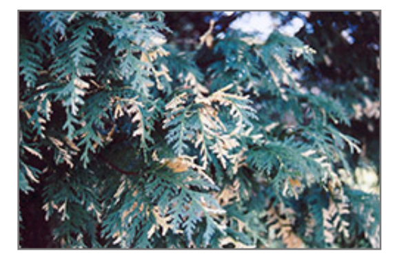
White Variegated Nootka Cypress foliage