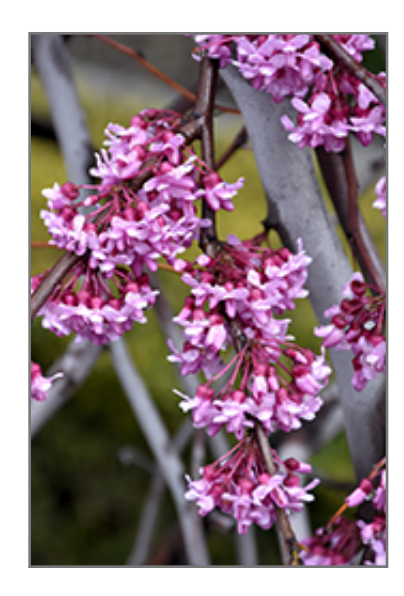
Lavender Twist Redbud flowers