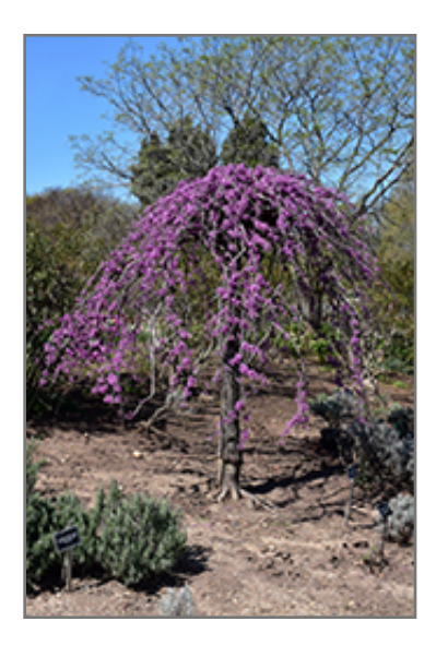
Lavender Twist Redbud in bloom

This is a relatively low maintenance shrub, and should only be pruned after flowering to avoid removing any of the current season's flowers. Deer don't particularly care for this plant and will usually leave it alone in favor of tastier treats. Gardeners should be aware of the following characteristic(s) that may warrant special consideration;