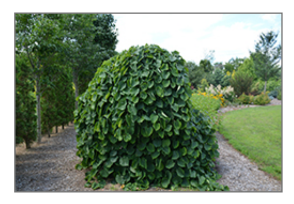
Lavender Twist Redbud

This shrub does best in full sun to partial shade. It prefers to grow in average to moist conditions, and shouldn't be allowed to dry out. It is not particular as to soil type or pH. It is highly tolerant of urban pollution and will even thrive in inner city environments, and will benefit from being planted in a relatively sheltered location. Consider applying a thick mulch around the root zone in winter to protect it in exposed locations or colder microclimates. This is a selection of a native North American species.