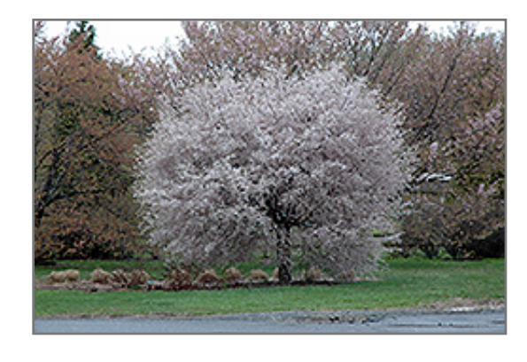
Hally Jolivette Flowering Cherry in bloom

Hally Jolivette Flowering Cherry is a dense multi-stemmed deciduous tree with a more or less rounded form. Its relatively fine texture sets it apart from other landscape plants with less refined foliage.