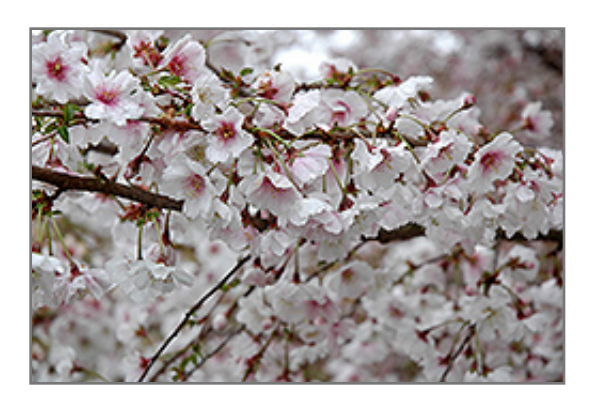
Hally Jolivette Flowering Cherry flowers

This is a relatively low maintenance tree, and is best pruned in late winter once the threat of extreme cold has passed. It has no significant negative characteristics.