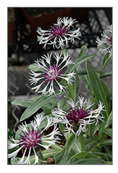
Amethyst In Snow Cornflower flowers

Amethyst In Snow Cornflower is recommended for the following landscape applications;