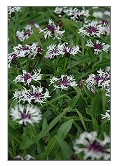
Amethyst In Snow Cornflower flowers