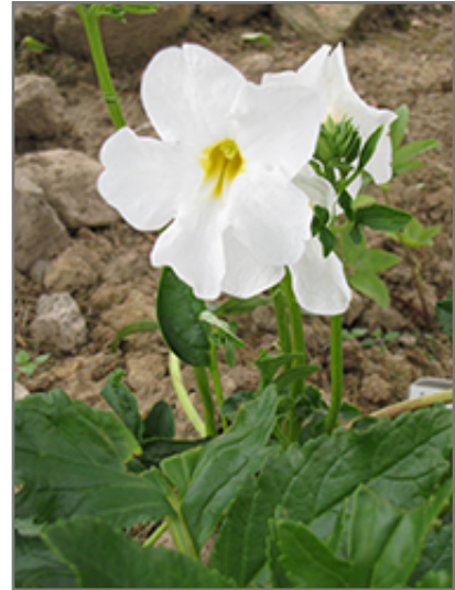
Snowtop Garden Gloxinia flowers