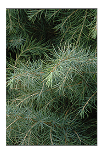
Deodar Cedar foliage