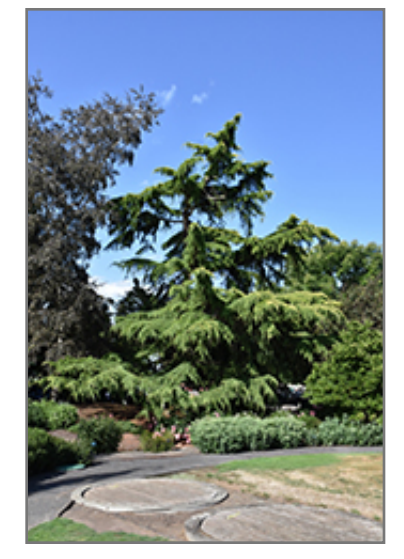
Deodar Cedar

This tree should only be grown in full sunlight. It is very adaptable to both dry and moist growing conditions, but will not tolerate any standing water. It is not particular as to soil type or pH. It is somewhat tolerant of urban pollution, and will benefit from being planted in a relatively sheltered location. This species is not originally from North America.