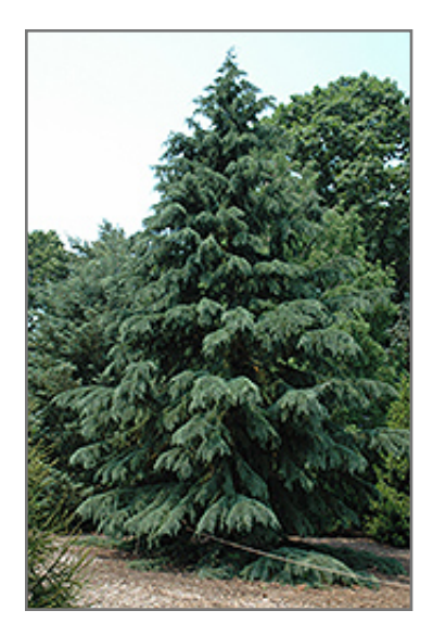
Deodar Cedar