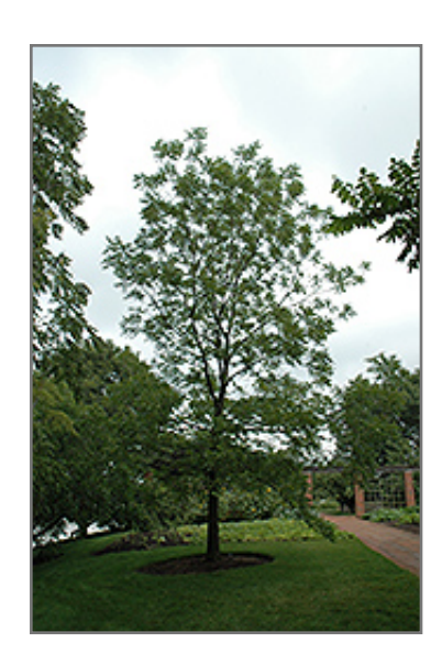
Riverside Pecan