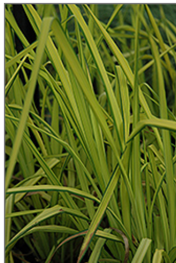
Bowles' Golden Sedge foliage