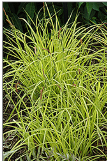
Bowles' Golden Sedge

Bowles' Golden Sedge is recommended for the following landscape applications;