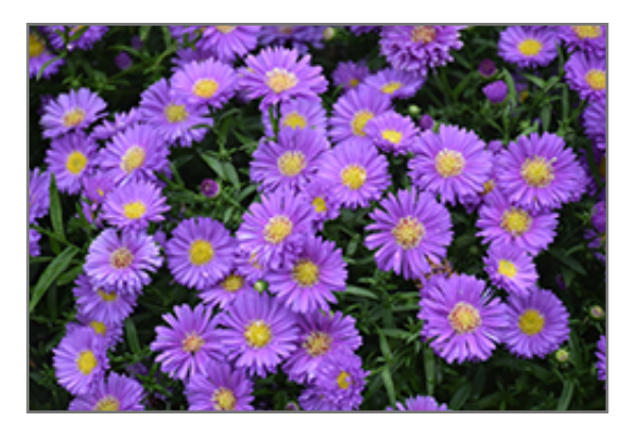
Magic Purple Aster flowers