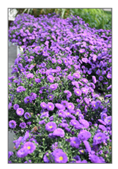
Magic Purple Aster in bloom