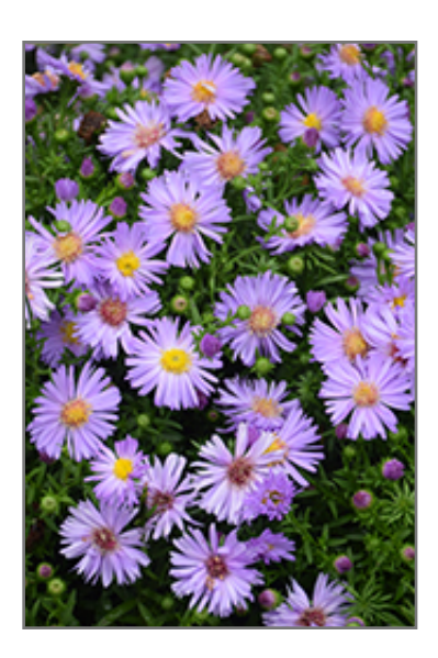
Daydream Lavender Aster flowers