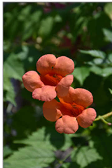
Indian Summer Trumpetvine flowers