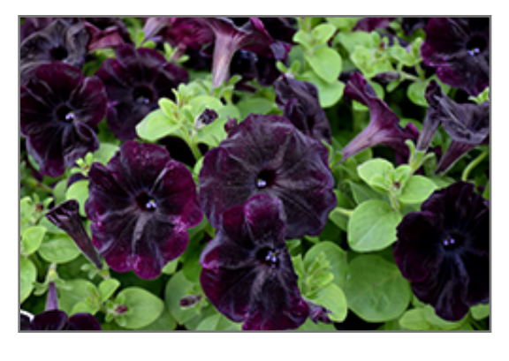
Starlet Velvet Petunia flowers

Hardiness Zone: (annual) Group/Class: Starlet Series