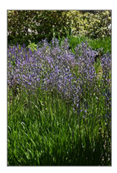
Blue Camassia in bloom