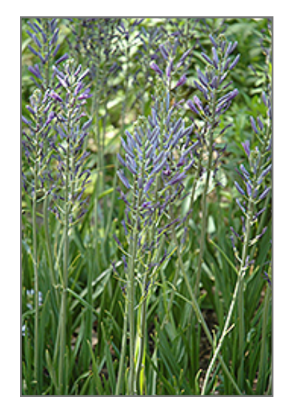
Blue Camassia flowers

Blue Camassia is recommended for the following landscape applications;