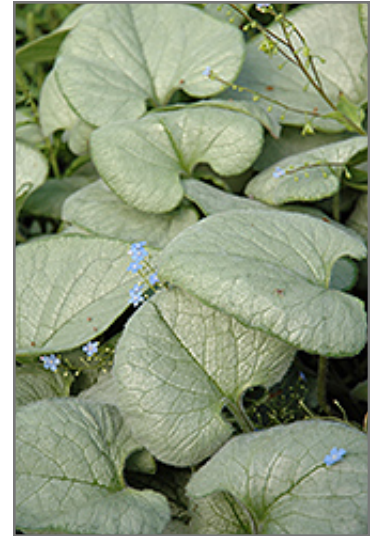
Looking Glass Bugloss foliage