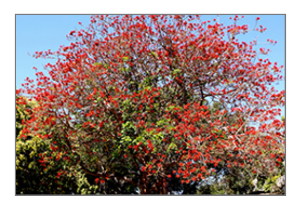
Australian Coral Tree in bloom

Australian Coral Tree is a multi-stemmed deciduous tree with an upright spreading habit of growth. Its relatively coarse texture can be used to stand it apart from other landscape plants with finer foliage.