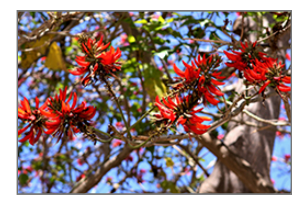
Australian Coral Tree flowers