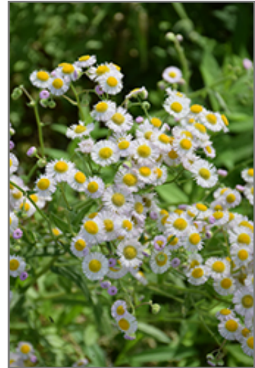
Philidelphia Fleabane flowers