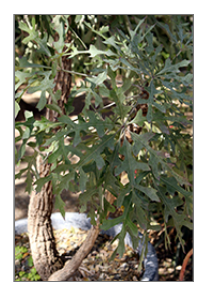
Mountain Cabbage Tree foliage