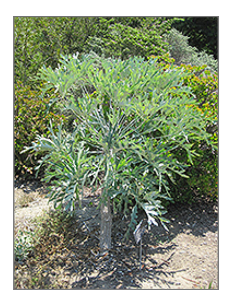
Mountain Cabbage Tree