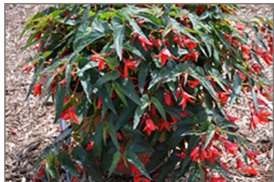
Mistral Red Begonia in bloom