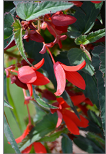
Mistral Red Begonia flowers