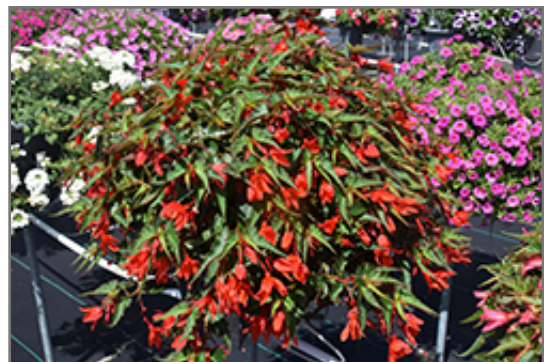
Mistral Orange Begonia in bloom