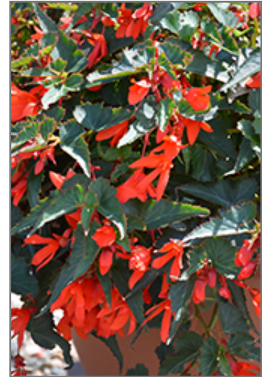
Mistral Orange Begonia flowers