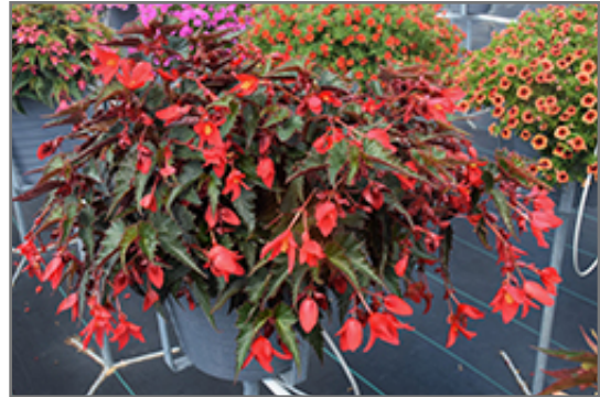
Mistral Dark Red Begonia in bloom