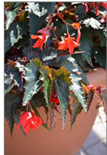
Mistral Dark Red Begonia flowers