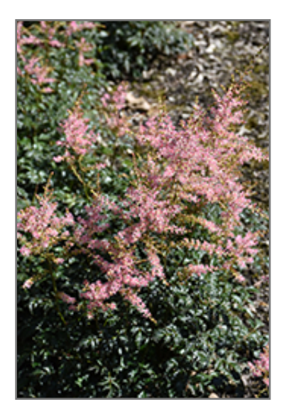
Hennie Graafland Astilbe flowers

A low maintenance, shade loving variety, featuring upright-mounded plants; soft pink plumes rise above mounds of ferny, toothed foliage; an excellent addition to shaded gardens, borders, containers or fresh-cut bouquets; low maintenance