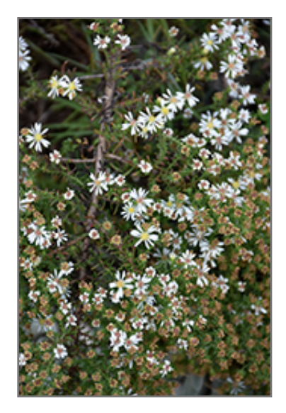
Snow Flurry Aster flowers

A drought tolerant, low growing, spreading variety that looks stunning in rock gardens, borders or as groundcover; features narrow green foliage and small, dainty white flowers that bloom during the fall; easy to grow, requiring little to no maintenance