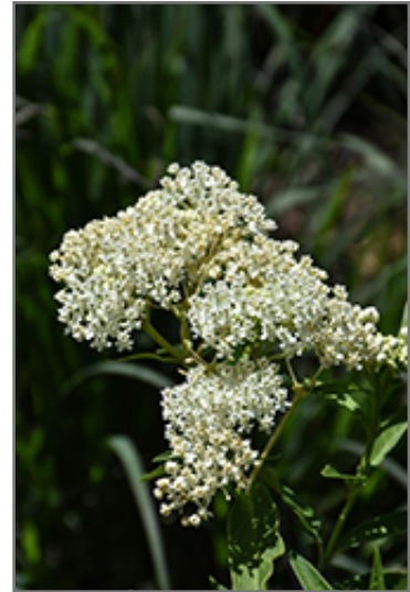
Ice Ballet Milkweed flowers