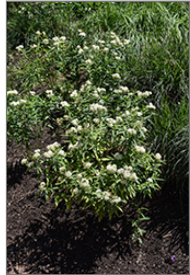
Ice Ballet Milkweed in bloom

This plant does best in full sun to partial shade. It is quite adaptable, preferring to grow in average to wet conditions, and will even tolerate some standing water. It is not particular as to soil type or pH. It is quite intolerant of urban pollution, therefore inner city or urban streetside plantings are best avoided. This is a selection of a native North American species. It can be propagated by division; however, as a cultivated variety, be aware that it may be subject to certain restrictions or prohibitions on propagation.