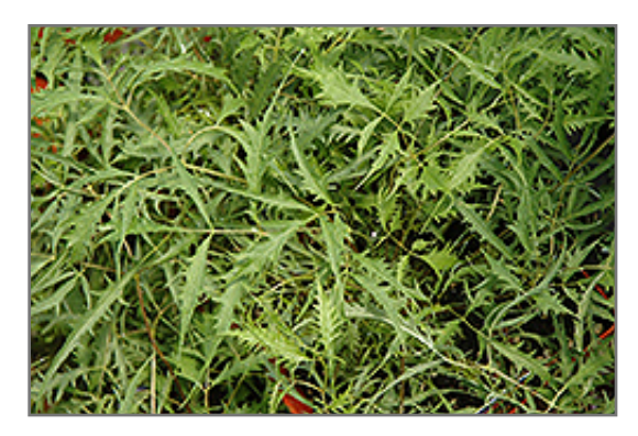
Cutleaf Goatsbeard foliage

Cutleaf Goatsbeard is recommended for the following landscape applications;