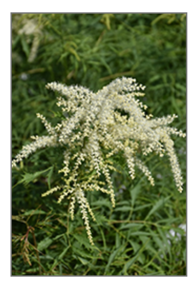
Cutleaf Goatsbeard flowers

This is a relatively low maintenance plant, and is best cleaned up in early spring before it resumes active growth for the season. It is a good choice for attracting butterflies to your yard, but is not particularly attractive to deer who tend to leave it alone in favor of tastier treats. It has no significant negative characteristics.