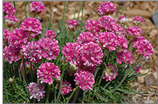
Red Sea Thrift flowers