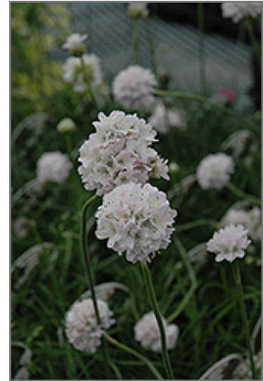
White Sea Thrift flowers