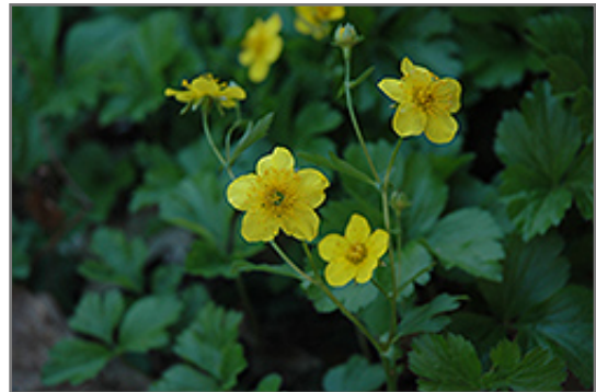
Barren Strawberry flowers