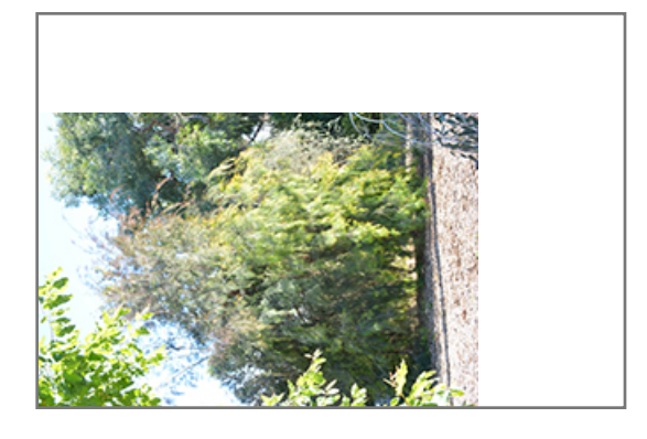
Forest Oak

An evergreen, medium-sized tree featuring pendulous, bronzy green foliage that is gracefully clustered at the branch tips; chestnut colored, corky bark is interesting; will re-sprout from the ground after a hard frost; a stunning landscape accent