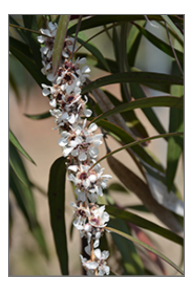
Burgundy Peppermint Willow flowers

This tree does best in full sun to partial shade. It does best in average to evenly moist conditions, but will not tolerate standing water. This plant will benefit from an application of bonemeal and/or mycorrhizal fertilizer at the time of planting. It is not particular as to soil type or pH, and is able to handle environmental salt. It is somewhat tolerant of urban pollution. This is a selected variety of a species not originally from North America.