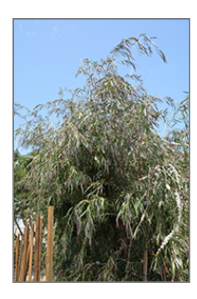
Burgundy Peppermint Willow

This is a relatively low maintenance tree, and should only be pruned after flowering to avoid removing any of the current season's flowers. It has no significant negative characteristics.