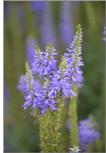
Spike Speedwell flowers

Spike Speedwell is recommended for the following landscape applications;