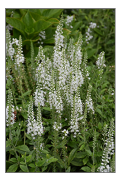
Icicle Speedwell flowers

An elegant looking bushy selection, with profuse spikes of pure white flowers throughout the summer; deadheading prolongs bloom time; tough and adaptable; excellent when massed in borders, and perfect for patio containers