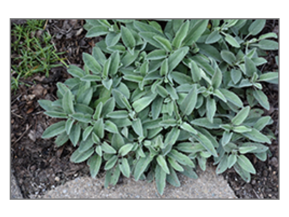
Pure Silver Wooly Speedwell

Valued for both its foliage and flowers, this selection features narrow, lance shaped, silver-gray leaves, forming a low mound; small blue flowers on terminal racemes appear from mid to late summer; not tolerant of high heat and high rainfall areas