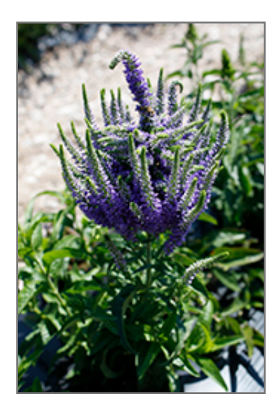
Baby Bloomer Blue Speedwell flowers

An easy to grow variety producing lovely lavender-blue flowers on short, dense spikes from late spring until autumn; compact bushy habit with dark green foliage; very uniform flowering; makes an ideal small groundcover, great in rock gardens