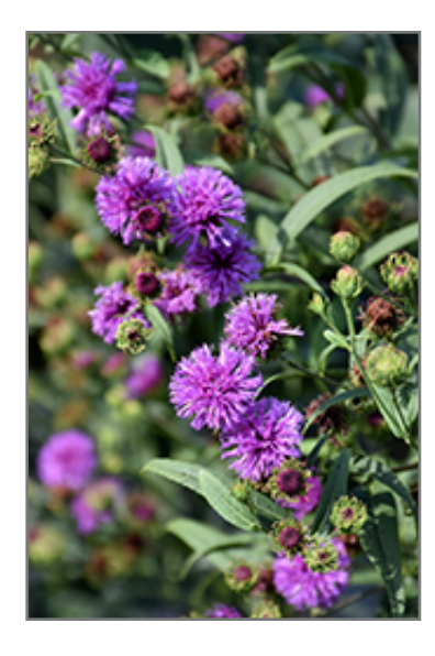
New York Ironweed flowers