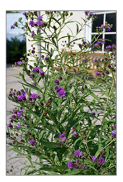
New York Ironweed flowers