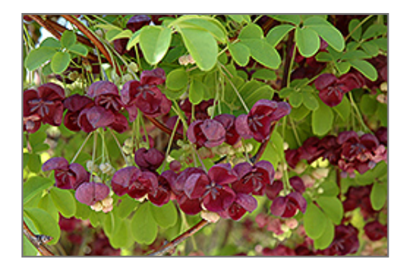
Fiveleaf Akebia flowers