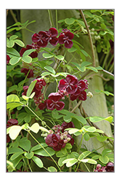
Fiveleaf Akebia flowers