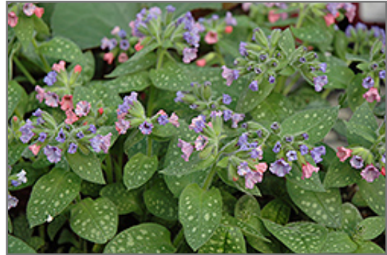
Mrs. Moon Lungwort flowers

Other Names: Lords And Ladies, Bethlehem Sage