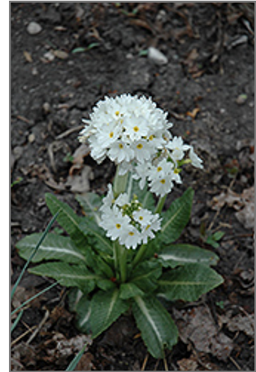
Ronsdorf Mix White Primrose in bloom