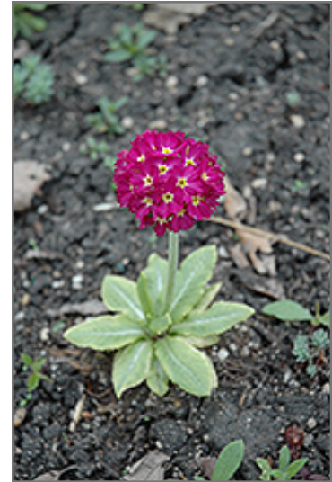
Ronsdorf Mix Red Primrose in bloom