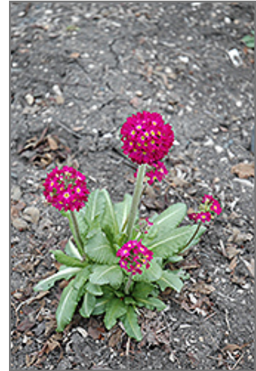
Ronsdorf Mix Purple Primrose in bloom