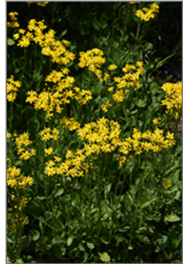
Roundleaf Ragwort in bloom

Roundleaf Ragwort is recommended for the following landscape applications;