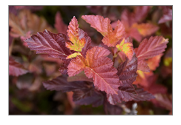
Center Glow Ninebark foliage

Center Glow Ninebark is a multi-stemmed deciduous shrub with an upright spreading habit of growth. Its average texture blends into the landscape, but can be balanced by one or two finer or coarser trees or shrubs for an effective composition.