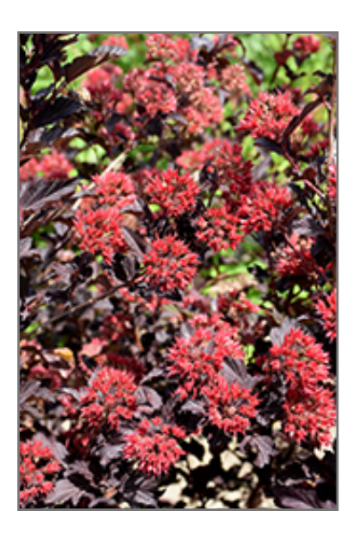
Center Glow Ninebark fruit

This shrub will require occasional maintenance and upkeep, and can be pruned at anytime. It has no significant negative characteristics.