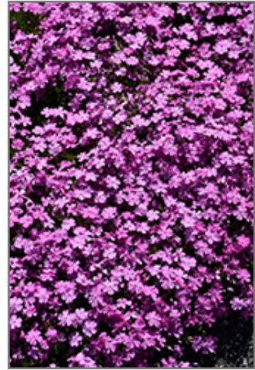
Emerald Pink Moss Phlox flowers

Emerald Pink Moss Phlox is smothered in stunning shell pink star-shaped flowers at the ends of the stems from early to late spring. Its tiny needle-like leaves remain emerald green in colour throughout the year.